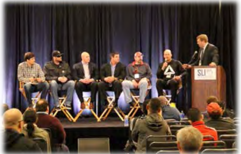
Current and former NFL players Hunter Hillenmeyer, Kyle Turley, Isaiah Kacyvenski, Ted Johnson, Kevin Turner, and Matt Hasselbeck with Chris Nowinski at Super Bowl press conference in New Orleans