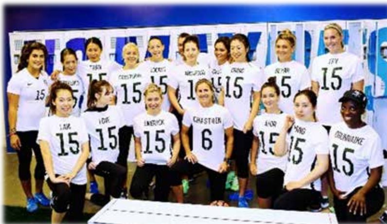
As part of Safer Soccer's #NoHeaderNoBrainer social media campaign, supporters reverse their jerseys to encourage a reversal of the youth heading rule.